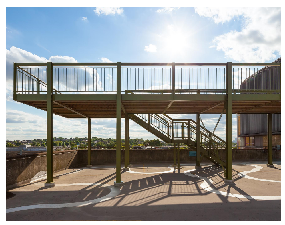
Observatory Bay & Upper Level